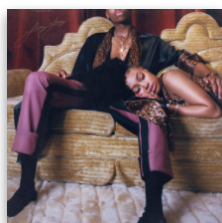
Lady Lady Released June 2018