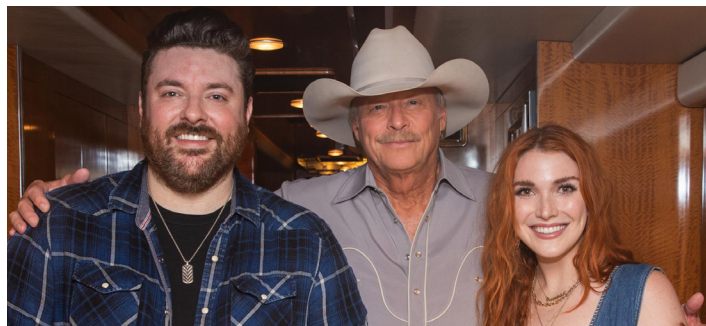
Alan Jackson (center) raised over $2 million in disaster relief with a June 26 concert in Newnan, Ga., which was hit by a tornado in March. The bill included Chris Young and Caylee Hammack.